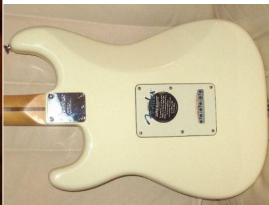
American Stratocaster 2003 ish